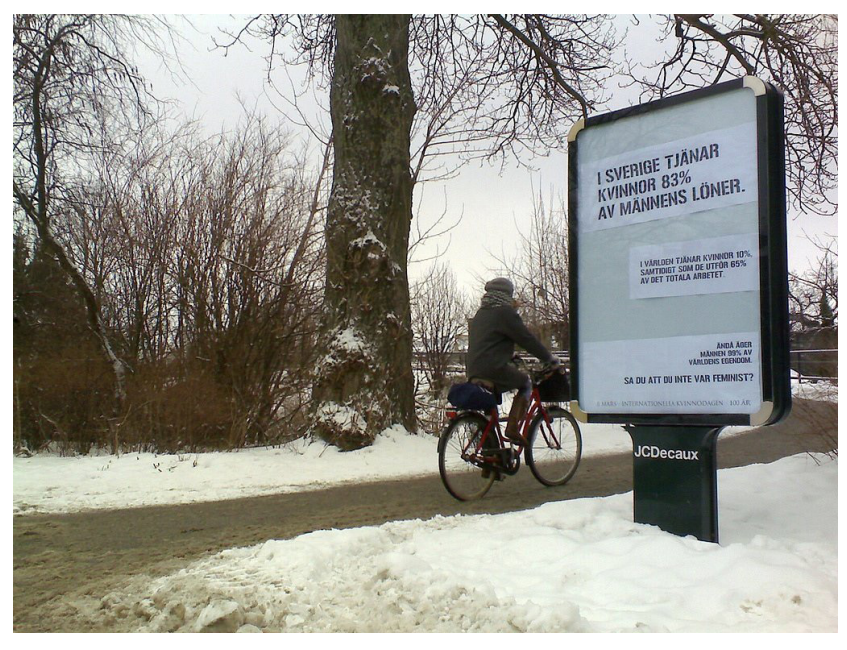
© Reclaim Reklam, taken on 27 February 2010

with family-friendly policies. Yet women are still overrepresented in relatively lowprestige, low-pay jobs and the gender pay gap is not entirely reducible to the career breaks that are still considered a natural corollary of women's ability to bear children (though the fact that the mother typically takes a longer career break than the father is not 'natural' but a consequence of the aptitude for caring that is a central component of the way in which femininity is socially constructed). Furthermore, businesses are encouraged to employ more women based on their supposedly 'feminine' qualities, like empathy and emotional intelligence; as recently as December 2018, Rosie Millard wrote in The Independent: "I think that the typically "female" traits of collegiate working,