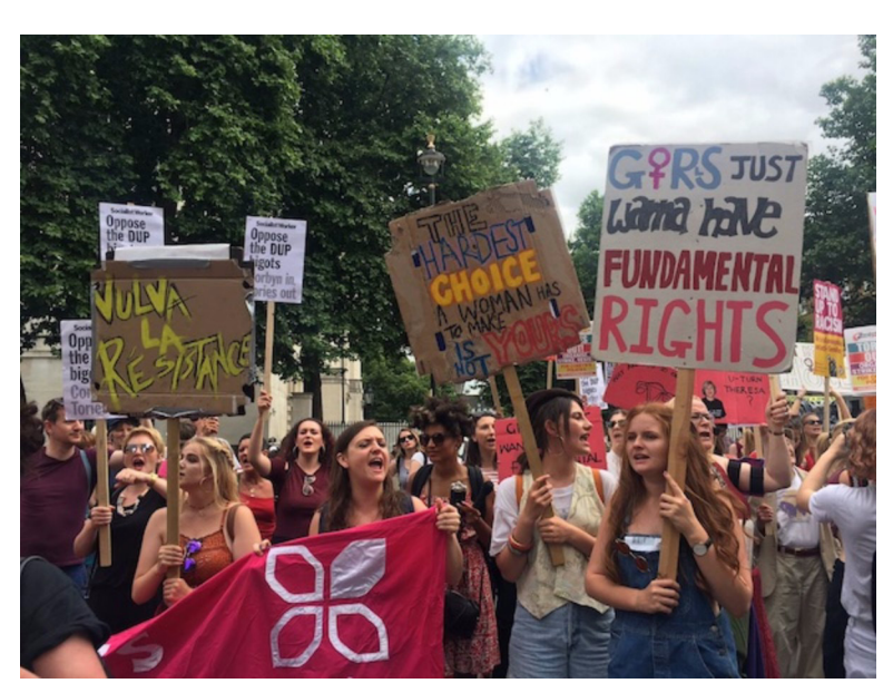
taken June 2017 Anti-DUP march in London

Albeit abortion has been legal in Great Britain for over fifty years, it remains